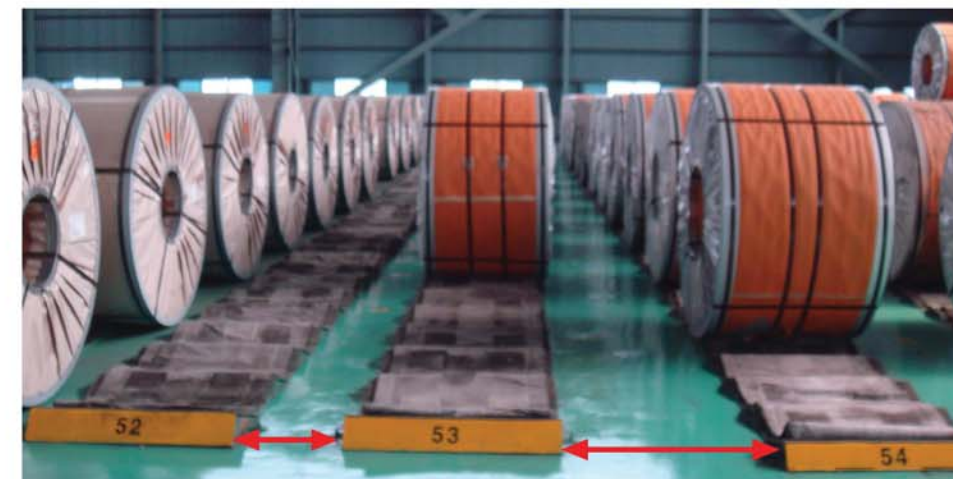
49 cm distance between skids for magnet use

• Thanks to the SGM voltage forcing device (a special device which consists in powering the magnet with an over-voltage for a few seconds so as to significantly shorten the time current takes to reach the rated value), the time magnet requires to grip and to release a coil is reduced to just a few seconds.