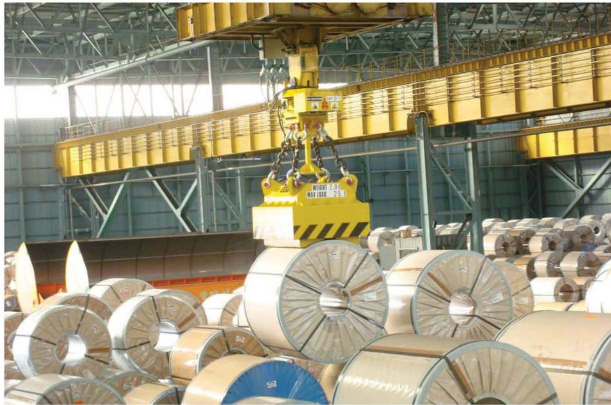
SGM magnet working in a fully automated coil storage plant.

• SGM magnet control system able to work in local or remote mode with simple transfer of data and interface with other systems (diagnostics).